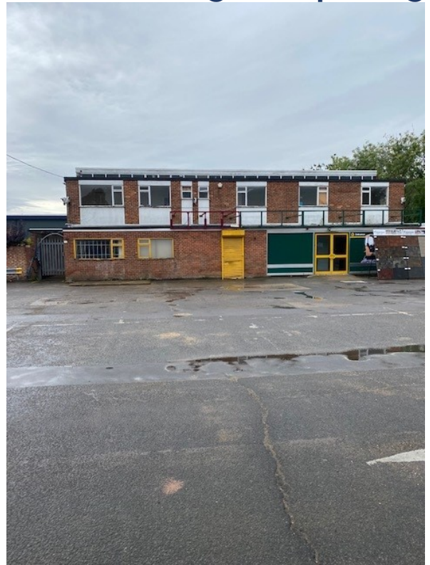
Woodley Green, Church Road Woodley, Reading RG5 4QP

Including various buildings comprising 15454 sq ft